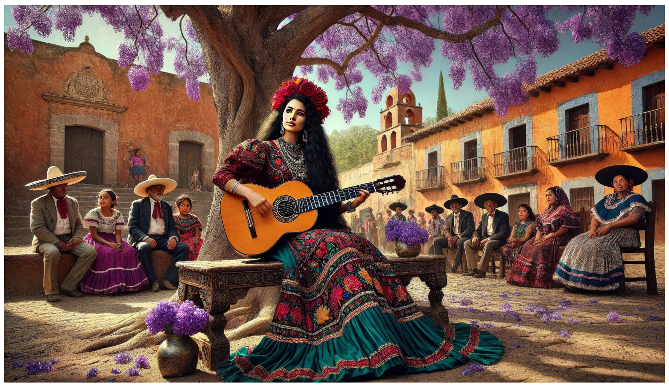
Where Do We Go From Here?